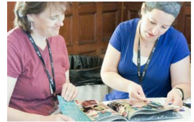
C.I.T.A.'s Summer Academy