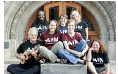
2015-2016 C.I.T.A. Teaching Artists Named