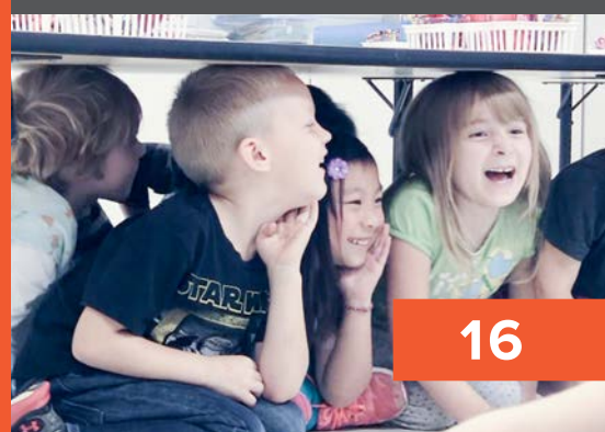
Artwork from P.A.I.N.T. program event at River Height's Family Night pictured in top left.