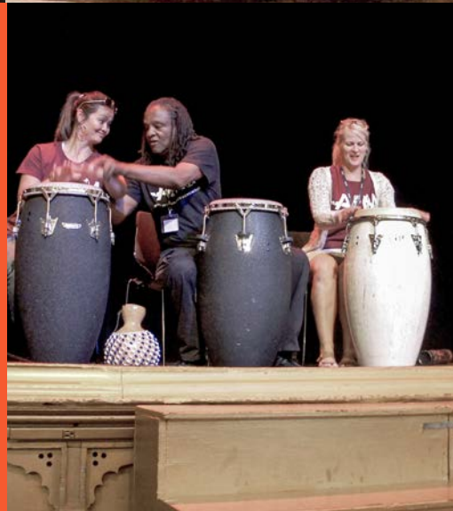
Pictured above, “Sophie and Phyllis” and friends celebrating arts integration!