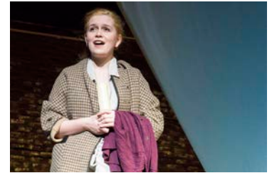
And Then They Came For Me