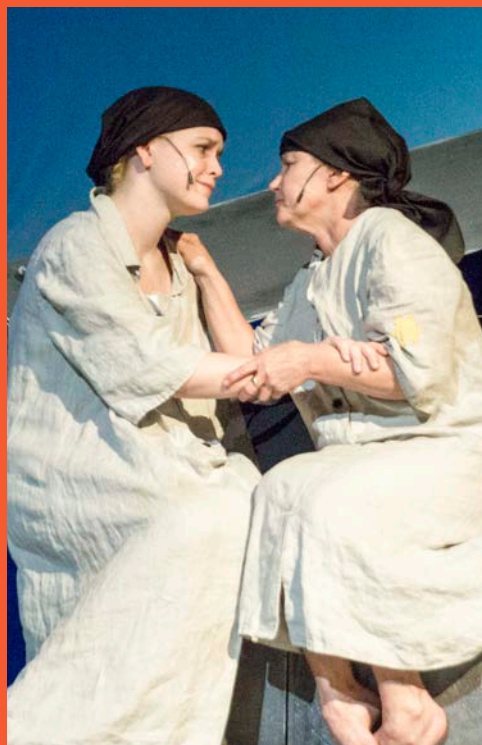
Pictured above are the cast and crew of And Then They Came For Me; Remembering the World of Anne Frank .

500 tickets for them. The culminating event of the theatrical experience, Holocaust survivor, Eva Schloss herself visiting from England, pictured above in blue, attended the private performance and participated in 2 post-performance question and answer sessions. During her visit, Eva also spoke at UW Stout to over 800 students, faculty, and community members. Both the production and Eva's presence left an impact on the community, one not soon to be forgotten, if ever.