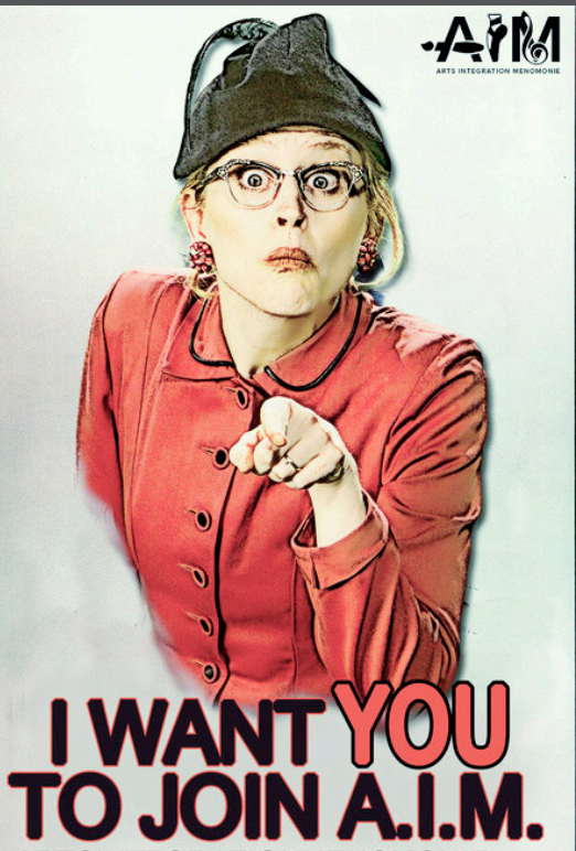
Promotional poster for Arts Integration Menomonie pictured below